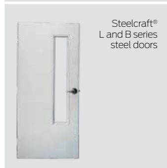
Steelcraft® L and B series steel doors