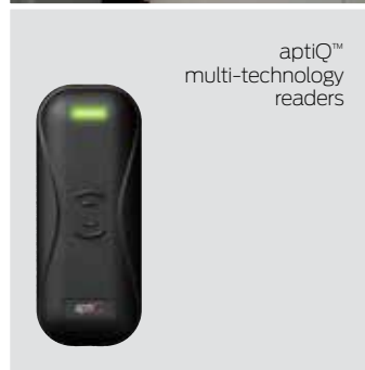
aptiQ™ multi-technology readers