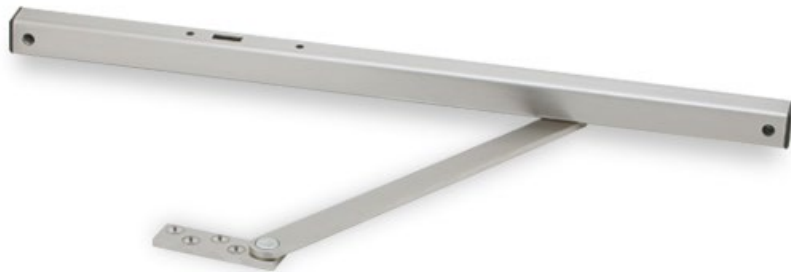
Glynn-Johnson 90 Series Surface Mounted Overhead Stop

This EPD was created using a UL-verified EPD generator for Allegion's full product portfolio. For additional product specific EPDs, please contact Allegion at sustainability@allegion.com .