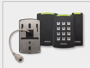
Reader controller PoE power and cabling required