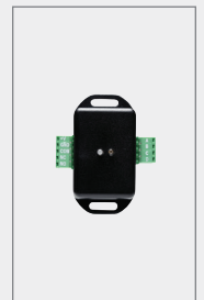
Advanced security module

Only 3 items are required for an ISONAS access control system