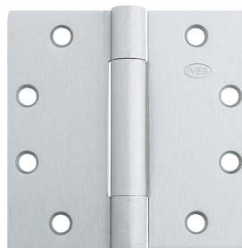
Figure 1: Ives Architectural Hinge

The products are manufactured at Indianapolis, IN facility in the US. It also accounts for international supply chains where relevant.