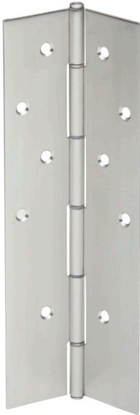
IVES Pin and Barrel Steel Continuous Hinge

This EPD was created using a UL-verified EPD generator for Allegion's full product portfolio. For additional product specific EPDs, please contact Allegion at Tim.Weller@allegion.com .