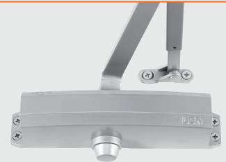
1250 Light Duty Cast Aluminum