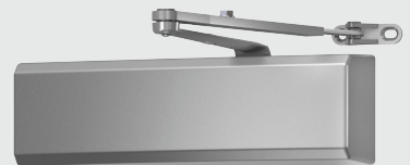
4050A Heavy Duty Cast Aluminum