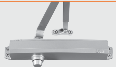
1450 Medium Duty Cast Aluminum