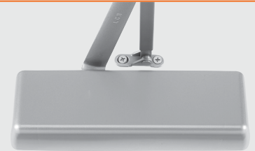
4040XP Heavy Duty Cast Iron