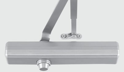
1460 Medium Duty Cast Iron