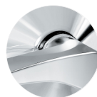
SF-625 Bright Chrome