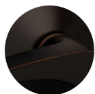
SF-613 Oil Rubbed Bronze