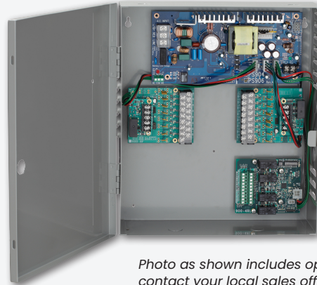
Photo as shown includes optional board(s). Please contact your local sales office or visit the support section on our website for configuration assistance.