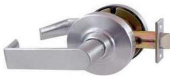
Figure 1: Schlage ND25 Series Lock

This EPD is representative of the Schlage manufacturing in the US and Mexico. It also accounts for international supply chains where relevant.