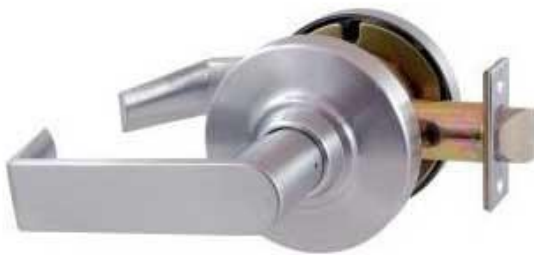
Schlage ND25 Series Lock

This EPD was created using a UL-verified EPD generator for Allegion's full product portfolio. For additional product specific EPDs, please contact Allegion at Tim.Weller@allegion.com .