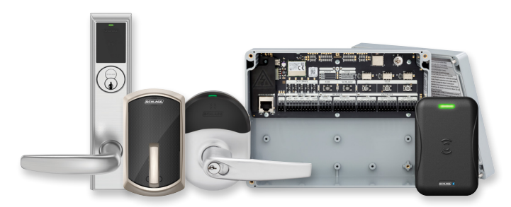
LE • Control • NDE • CTE • MTB

For more information on ENGAGE, visit allegionengage.com.