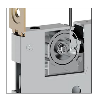
Schlage spool assembly