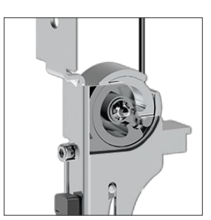
Von Duprin spool assembly