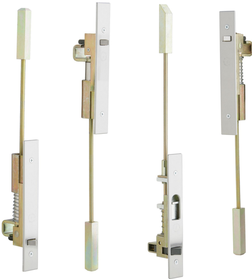
IVES Flush Bolts – FB31 Series Automatic Flush Bolt (left) and FB51 Series Constant Latching Flush Bolt (right)

This EPD was created using a UL-verified EPD generator for Allegion's full product portfolio. For additional product specific EPDs, please contact Allegion at sustainability@allegion.com .