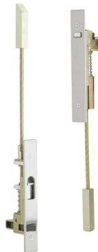
Figure 2: Ives FB51P Constant Latching Flush Bolt

Because of the wide range of sizes and finishes available, this EPD presents results are presented separately for each product family for the most common size based on sales volume. Results presented in this EPD are representative as a worst-case scenario of all available finishes of FB31 series and FB51 series flush bolts in a 12" size. This is based on weight and composition of materials.