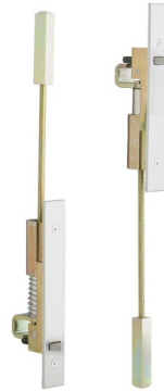
Figure 1: Ives FB31P Automatic Flush Bolt

According to ISO 14025, EN 15804 and ISO 21930:2017