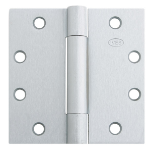
Figure 1: Ives Architectural Hinge

The products are manufactured at Indianapolis, IN facility in the US. It also accounts for international supply chains where relevant.