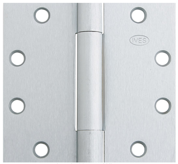
Ives Architectural Hinge

This EPD was created using a UL-verified EPD generator for Allegion's full product portfolio. For additional product specific EPDs, please contact Allegion at Tim.Weller@allegion.com.