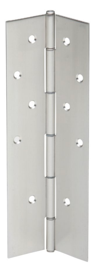
IVES Pin and Barrel Steel Continuous Hinge

This EPD was created using a UL-verified EPD generator for Allegion's full product portfolio. For additional product specific EPDs, please contact Allegion at Tim.Weller@allegion.com.