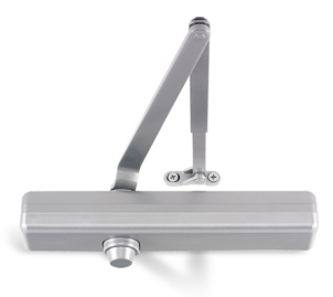
Figure 1: LCN 1460 Series Door Closer

This EPD is representative of manufacturing in the US. It also accounts for international supply chains where relevant.