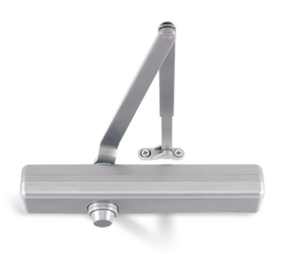
LCN 1460 Series Door Closer

This EPD was created using a UL-verified EPD generator for Allegion's full product portfolio. For additional product specific EPDs, please contact Allegion at Tim.Weller@allegion.com.