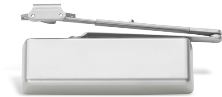
LCN 4040XP Series Door Closer

This EPD was created using a UL-verified EPD generator for Allegion's full product portfolio. For additional product specific EPDs, please contact Allegion at Tim.Weller@allegion.com .