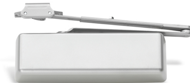
Figure 1: LCN 4040XP Door Closer

The LCA for this EPD is based on LCN 4040XP. The LCN 4040XP and 4040XPT Series Door Closers environmental impacts are within \pm 10\% of each other. This EPD is representative of manufacturing in the US.