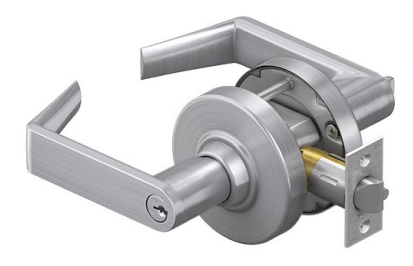
Figure 1: Representative Schlage ALX Series Lock

The products can be manufactured at either one of Schlage's manufacturing plants in Security, Colorado or Ensenada, Mexico. This EPD is representative of the Schlage manufacturing in the US and Mexico. It also accounts for international supply chains where relevant.