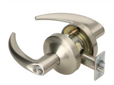
Figure 1: Schlage ND Series Lock

This EPD is representative of the Schlage manufacturing in the US and Mexico. It also accounts for international supply chains where relevant.