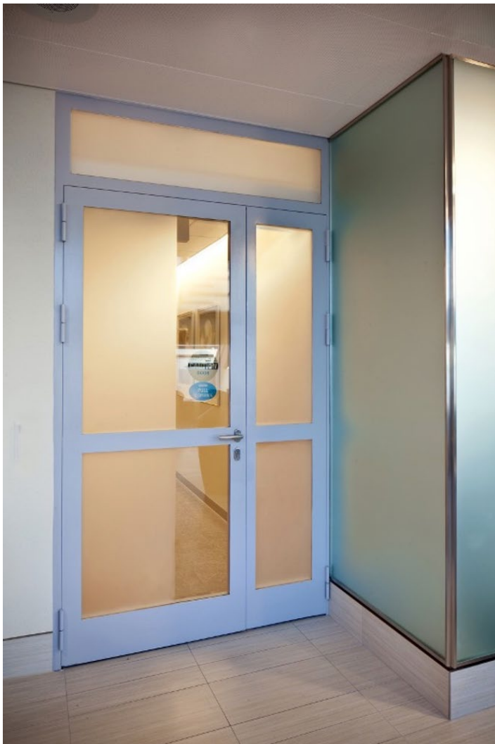
Fireframes® Designer Series Fire-rated Doors and Frames

FIRELITE PLUS® MONOLITHIC GLASS, FIRELITE® MONOLITHIC GLASS, AND FIRELITE® NT MONOLITHIC GLASS