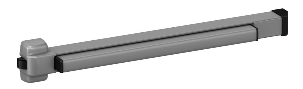
Figure 1: Von Duprin 22 Series Door Exit Device

Von Duprin 22 Series wide stile devices provide coverage for most standard applications. With rim and surface vertical configurations, combined with mechanical and electronic options, it offers a cost-effective solution for medium to low traffic areas where proven reliability is needed. These devices are ANSI A156.3, Grade 1 certified, and UL listed for Panic and Fire Hardware. The 22 Series is designed and manufactured in accordance to ISO 9001 Quality Management System. This EPD is representative of manufacturing in the US. It also accounts for international supply chains where relevant.