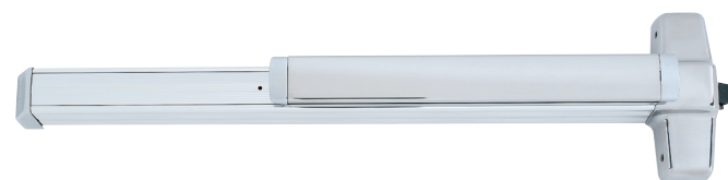
Von Duprin® 99 Series panic hardware

by code to unlock upon fire alarm. The door between the stairwell and the roof may be required, or desired, to be fail safe. This is not typical and is not a requirement of the International Building Code or NFPA 101—The Life Safety Code. I have only worked on a few projects during my career where the path of egress led onto the roof.