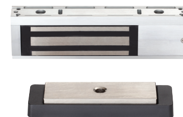
Schlage® M400 Series electromagnetic locks

only available fail safe. When you remove power, the electromagnetic lock unlocks. Because mag-locks do not provide free egress like other electrified