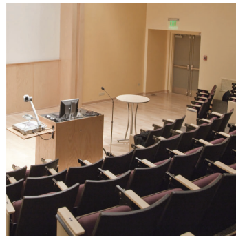
Cross corridor fire doors