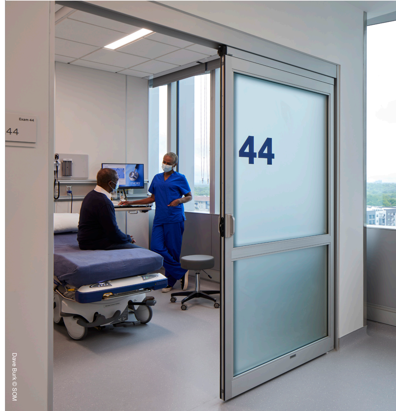
Dave Burk © SOM