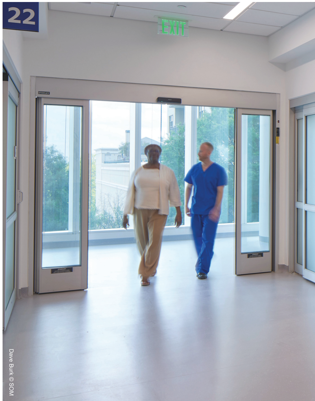
Dave Burk © SOM