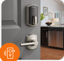
Unit Devices & Smart Apartment