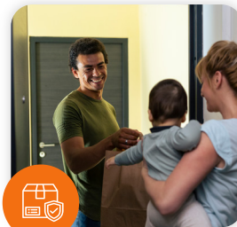
Package & Food Delivery

Still feeling like you don't understand the ins and outs of Proptech? We've got you covered. Download our free beginner's guide .