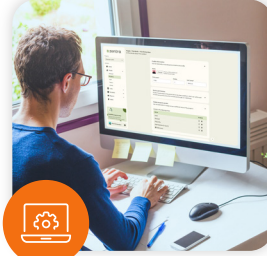
Property Management Software