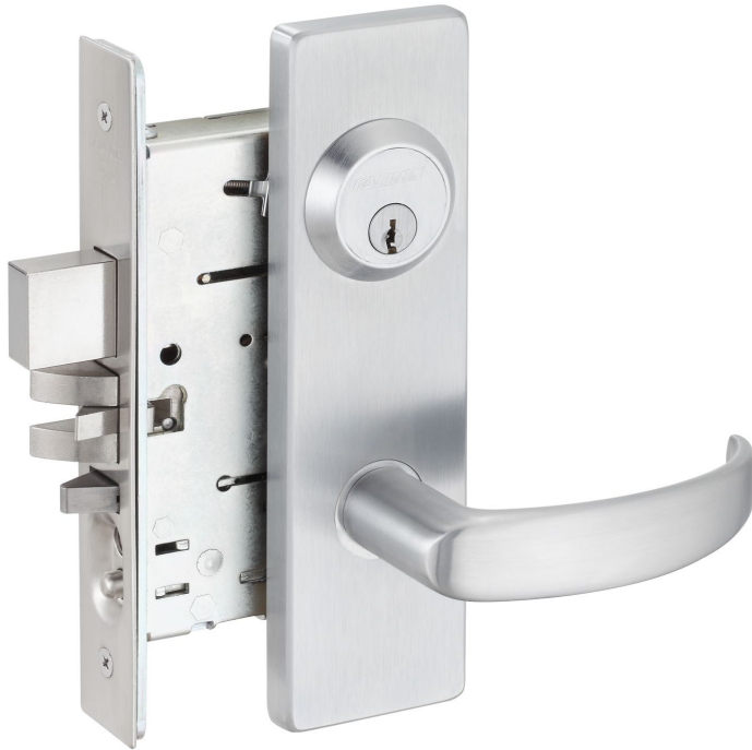
Falcon MA Series Mortise Locks

This EPD was created using a UL-verified EPD generator for Allegion's full product portfolio. For additional product specific EPDs, please contact Allegion at sustainability@allegion.com .