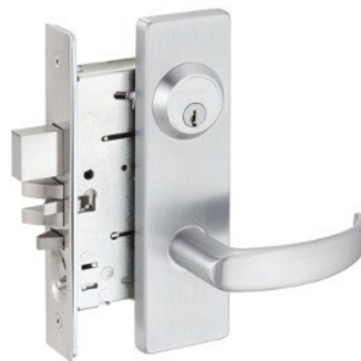
Figure 1: Falcon MA Series Mortise Lock

The MA Series boasts a robust construction using cold-formed steel, zinc plated with a dichromate finish for superior corrosion resistance. It carries a UL listing for 3-hour fire doors. Furthermore, the MA Series features a 2-piece anti-friction stainless steel, field reversible latch bolt providing easy re-handing of the lock in the field.