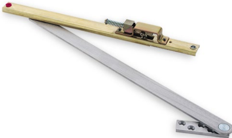
Glynn-Johnson Concealed Overhead Stop – 100 Series

This EPD was created using a UL-verified EPD generator for Allegion's full product portfolio. For additional product specific EPDs, please contact Allegion at sustainability@allegion.com .