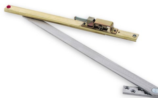
Figure 1: Glynn-Johnson Concealed Overhead Stop 100 Series

Overhead stops are available in a range of opening functions: friction hold-open and stop, hold-open and stop, internal hold-open and stop, and stop-only.