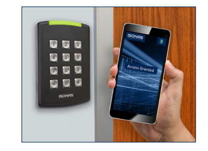
3 Present the smart phone to complete enrollment and you're all set!