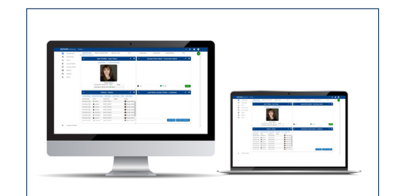
2 Enroll the user in Pure Access™