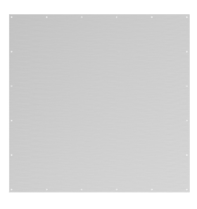
Figure 1: IVES Armor Plate

The standard application is one armor plate per standard 3' x 7' door leaf. This EPD presents results for this application.