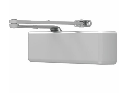
Figure 1: LCN 4010 Series Door Closer

This EPD is representative of manufacturing in the US. It also accounts for international supply chains where relevant.