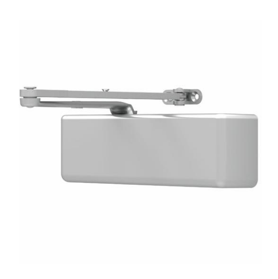
LCN 4010 Series Door Closer

This EPD was created using a UL-verified EPD generator for Allegion's full product portfolio. For additional product specific EPDs, please contact Allegion at Tim.Weller@allegion.com.