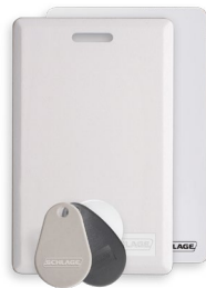
Schlage pre-programmed credential packs