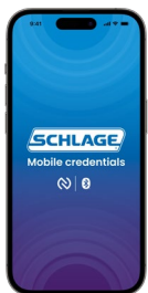
Schlage mobile credentials (included in software, no additional charge)