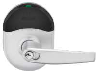
NDEB mobile enabled cylindrical lock