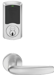
LEB mobile enabled mortise lock