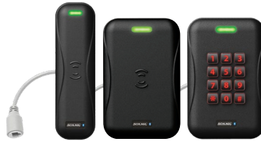
POE reader controllers