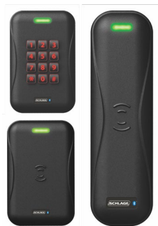
Figure 1: Schlage MTB Series Readers: MTB11 (right), MTB15 (bottom left), MTBK15 (top left)

The readers come in three different form factors, MTB11, MTB15, and MTBK15. The MTB11 is designed for mounting on a mullion or where a junction box is not available. The MTB15 is designed to be mounted on a single gang junction box as is the MTBK15 with the difference being that the latter also included a keypad as part of the design and functionality of the reader. In addition to their form, the readers are also available in 4 different finishes; black, cool tone gray, cream, and warm tone gray.