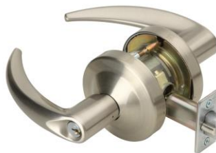
Figure 1: Schlage ND Series Lock

This EPD is representative of the Schlage manufacturing in the US and Mexico. It also accounts for international supply chains where relevant.