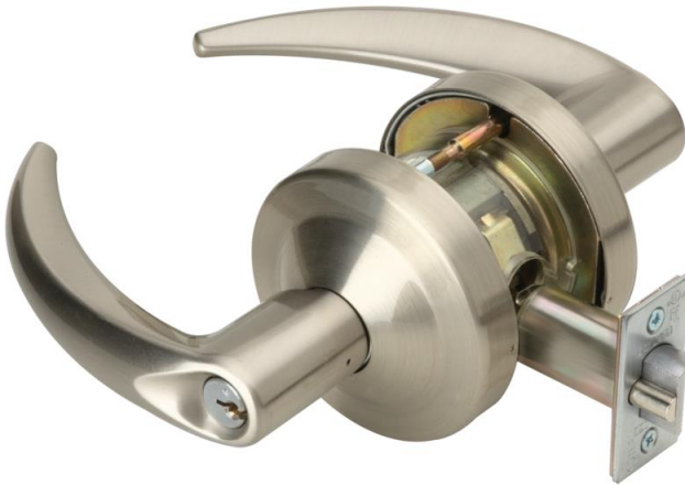
Schlage ND Series Lock

LOCKS – ND10, ND12, ND12EL, ND12EU, ND30, ND40, ND44, ND45, ND50, ND53, ND60, ND60CLOSED, ND66, ND70, ND70X80, ND72, ND72VANDL, ND73, ND75, ND 80, ND80EL, ND80EU, ND82, ND85, ND91, ND92, ND93, ND94, ND95, ND96, ND96EL, ND96EU, ND97, ND170