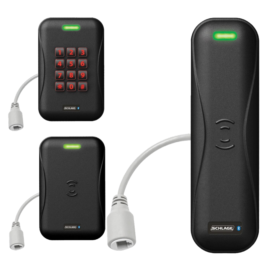
Schlage Card Reader Controllers

This EPD was created using a UL-verified EPD generator for Allegion's full product portfolio. For additional product specific EPDs, please contact Allegion at sustainability@allegion.com .