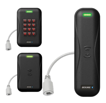
Figure 1: Schlage Reader Controllers Series RC11 (right), RC15 (bottom left), RCK15 (top left)

The reader controllers is manufactured in a black finish and come in three different form factors, RC11, RC15, and RCK15. The RC11 is designed for mounting on a mullion or where a junction box is not available. The RC15 is designed to be mounted on a single gang junction box as is the RCK15 with the difference being that the latter also included a keypad as part of the design and functionaility of the reader.