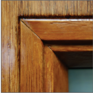
Recessed Designer™ glass trim