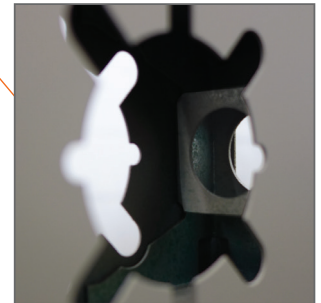
61L cylindrical lock universal features