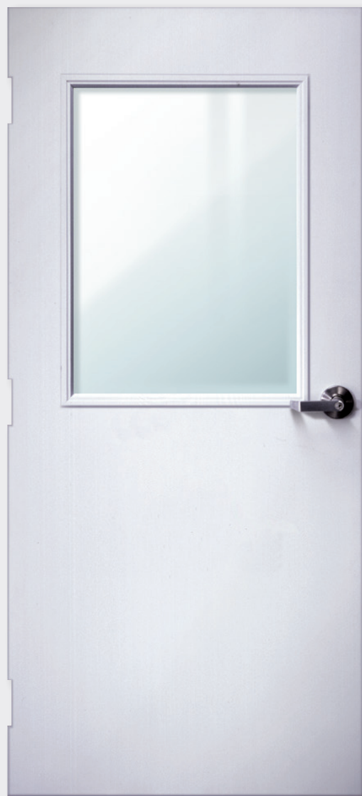
Standard L Series Door