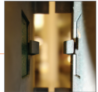
Mortise lock body stabilizers