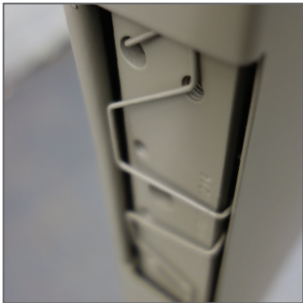
Universal hinge preparations with true 7-gauge reinforcements