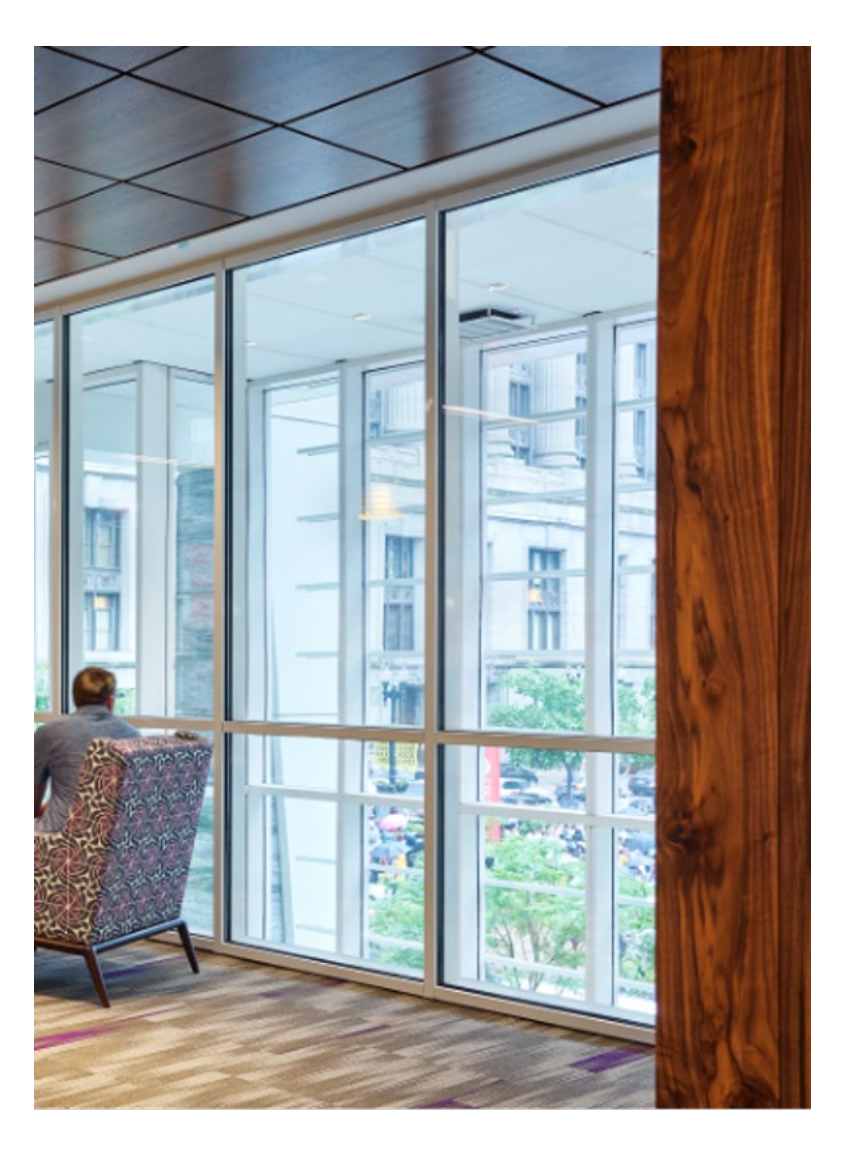
Fireframes® Curtainwall Series Fire-rated Frames

This EPD was created using a UL-verified EPD generator for Allegion's full product portfolio. For additional product specific EPDs, please contact Allegion at Tim.Weller@allegion.com.