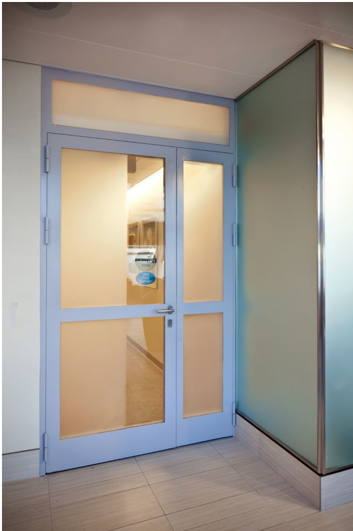
Fireframes® Designer Series Fire-rated Doors and Frames

FIRELITE PLUS® IGU, FIRELITE® IGU, AND FIRELITE® NT IGU